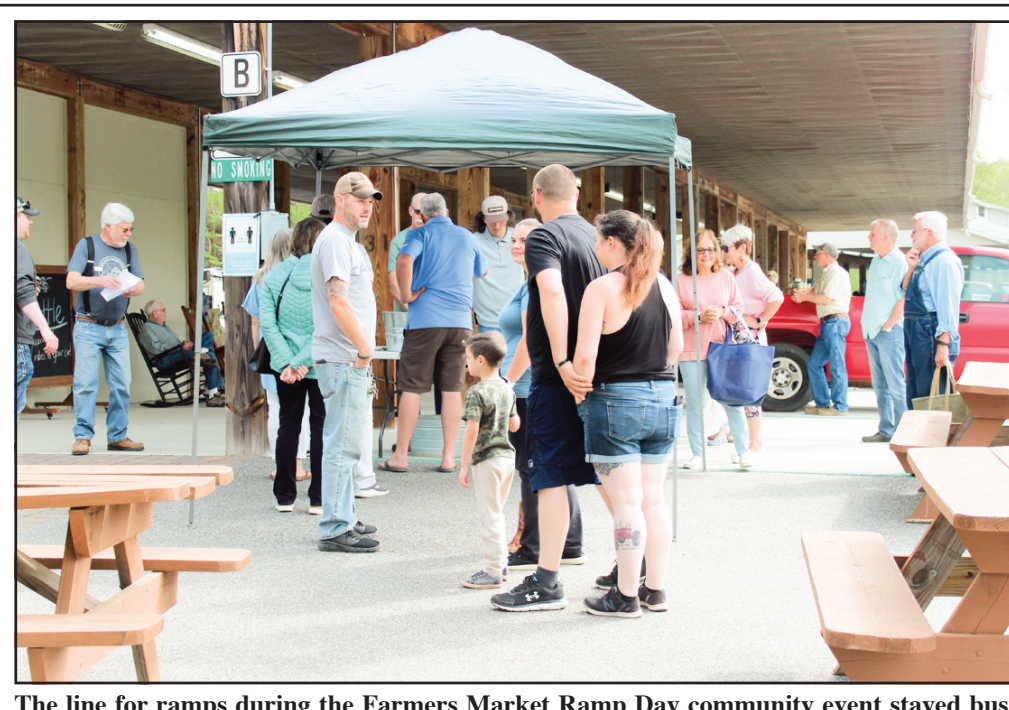
The line for ramps during the Farmers Market Ramp Day community event stayed busy while supplies lasted on April 30.

Also highlighted was the Trash & Treasures Yard Sale, to begin on May 20 and run