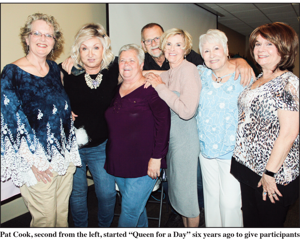
the love and attention they deserve after battling cancer.

There's no denying that want to do." the battle to overcome cancer is a difficult one. As such, survivors need all the love and support they can get; even years out in remission, their strength should be celebrated.