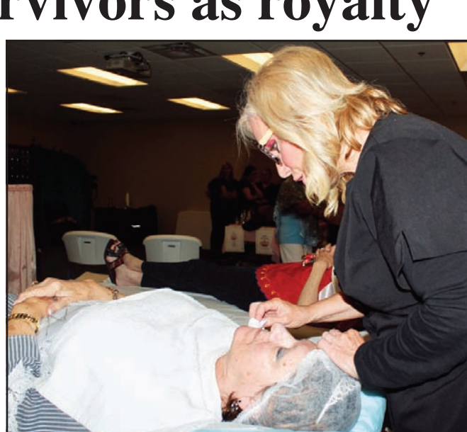
Cancer survivors were treated to a special day of facials, make-up and hair during "Queen for a Day" on April 25.