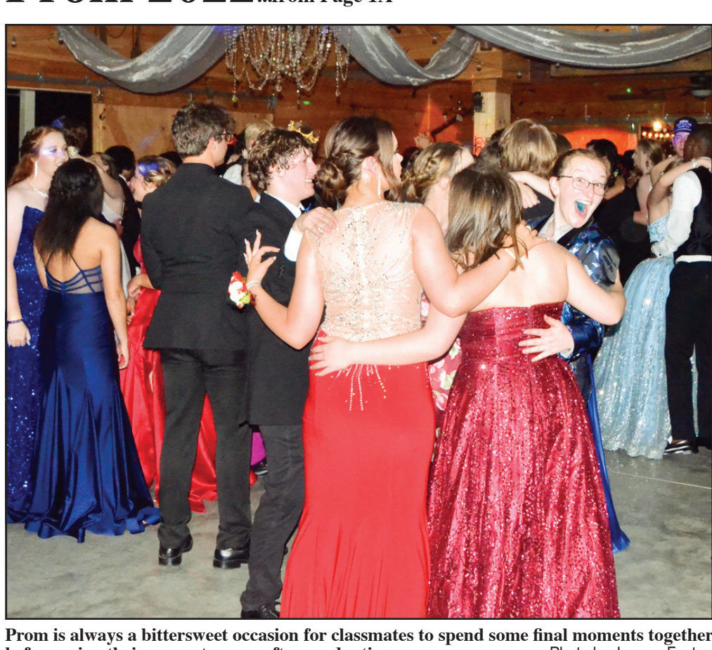
before going their separate ways after graduation.